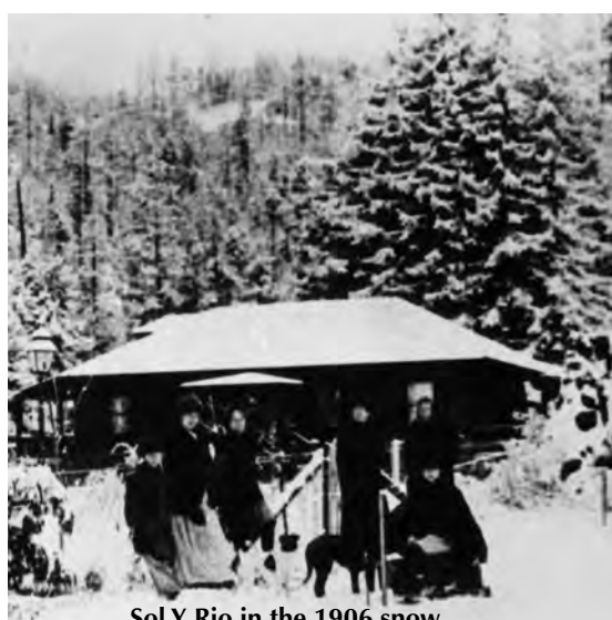
Sol Y Rio in the 1906 snow.

The footprint of the original house was expanded over the years to add rooms and incorporate at least two porches. An interior redwood wall was removed - with help from Rich Holmer - to create a large central dining-living room, and the wood was reused to build the dropped ceiling that's still there today.